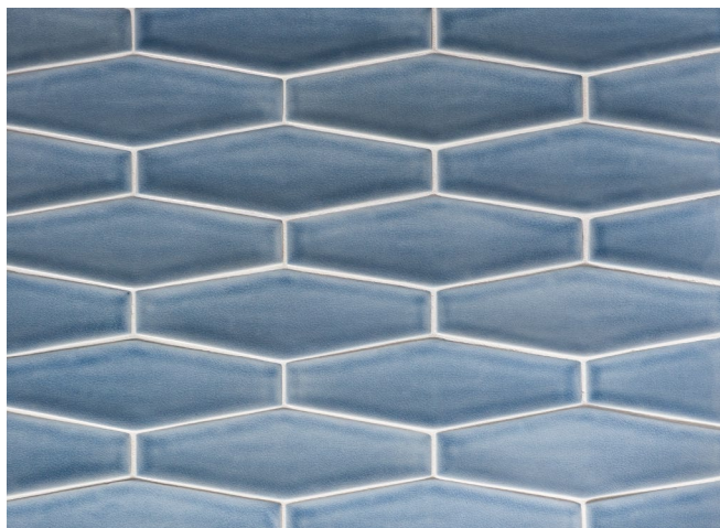
TONAL VARIATION WITH LIGHT & DARK TILE

Make sure your installer reads our installation instructions thoroughly to achieve the best look.